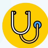
Specialist Outpatient Clinics