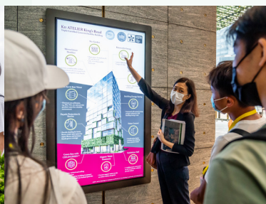
K11 ATELIER King's Road