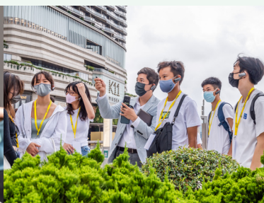
K11 MUSEA Victoria Dockside